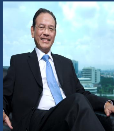
Kanaka Puradiredja Independent Commissioner